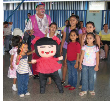
Party for last year’s pediatric heart patients, now enjoying a healthier childhood.

“The Montefiore/HCI team is already planning its next mission to El Salvador, currently scheduled to take place spring 2010. ♥