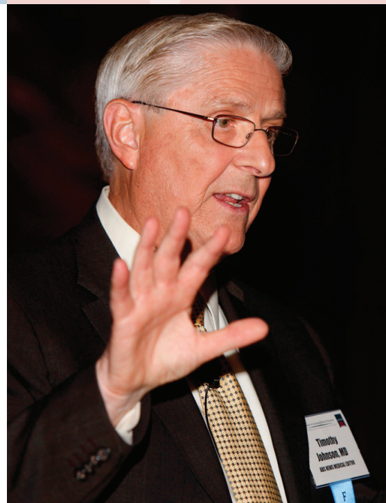
Timothy Johnson, MD, from ABC News lectures at heart failure symposium